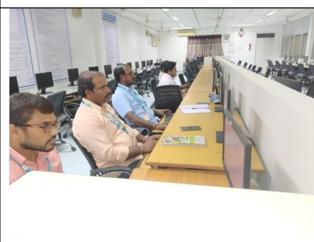
Writing Exam at IT Laboratory